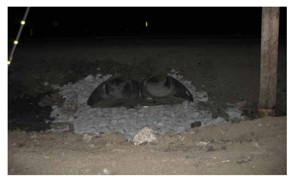
Flared End and RSP drainage Rock on Stage 1