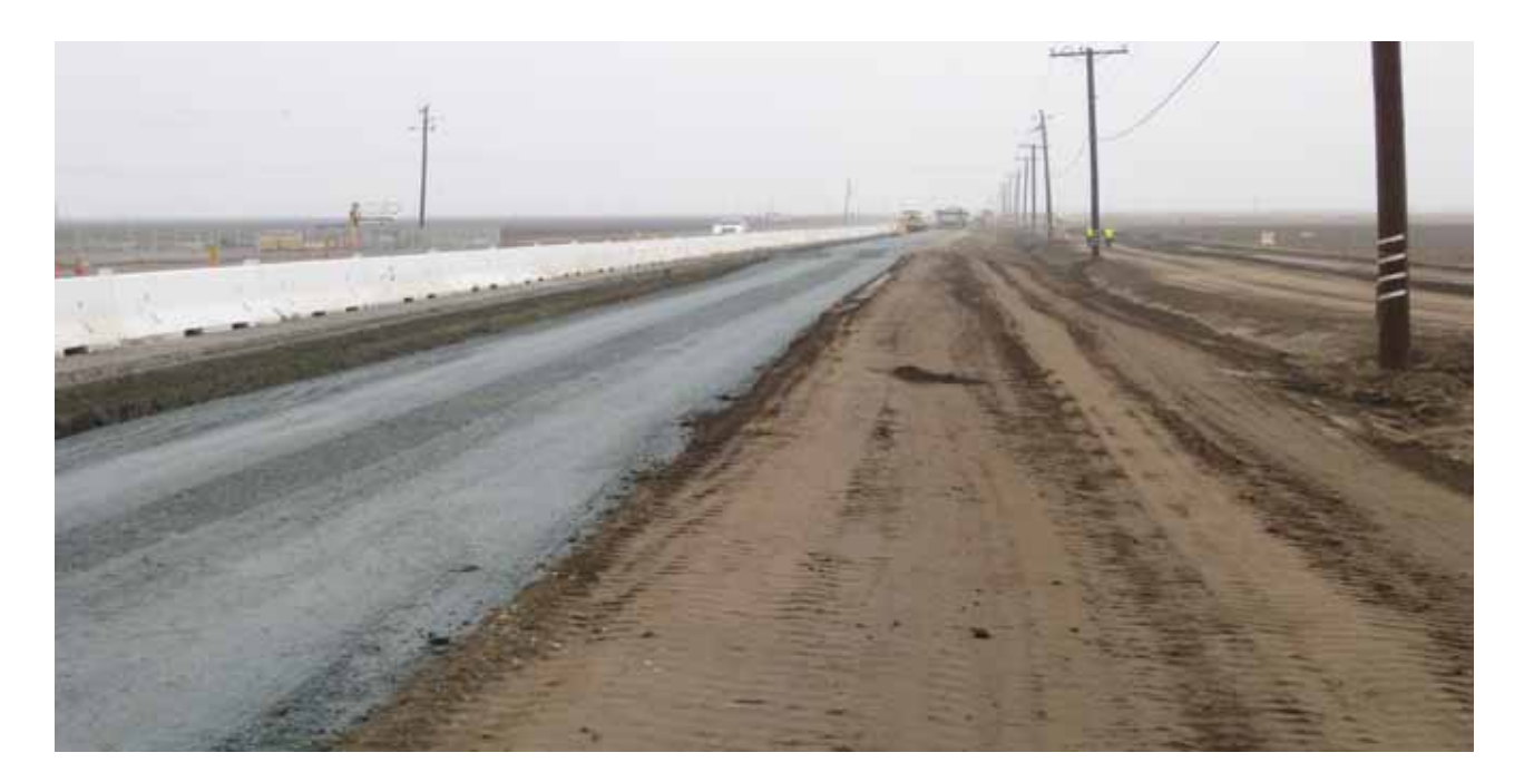
Embankment and Shoulder Widening on Stage 2