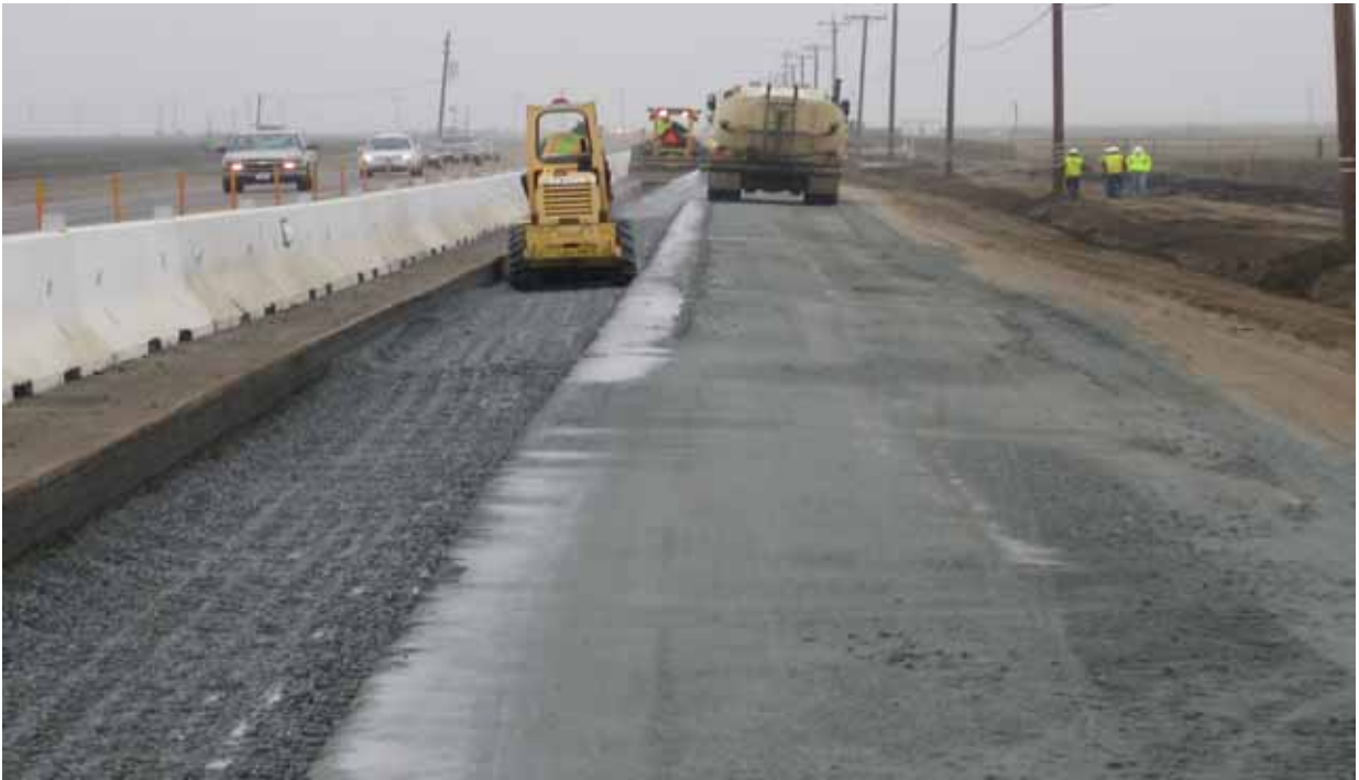
Stage 2 Traveled Way