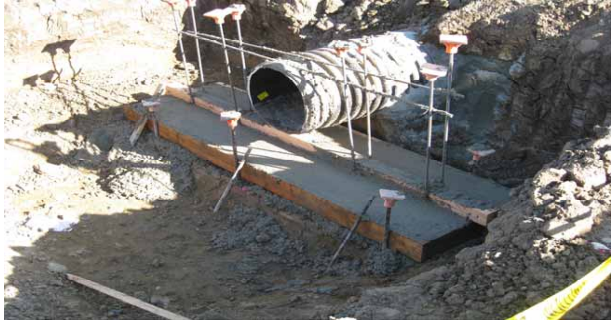
Headwall on Stage 1 Drainage